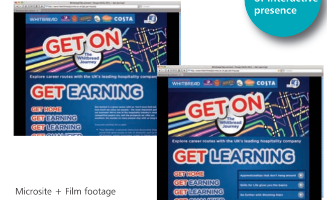
Microsite + Film footage